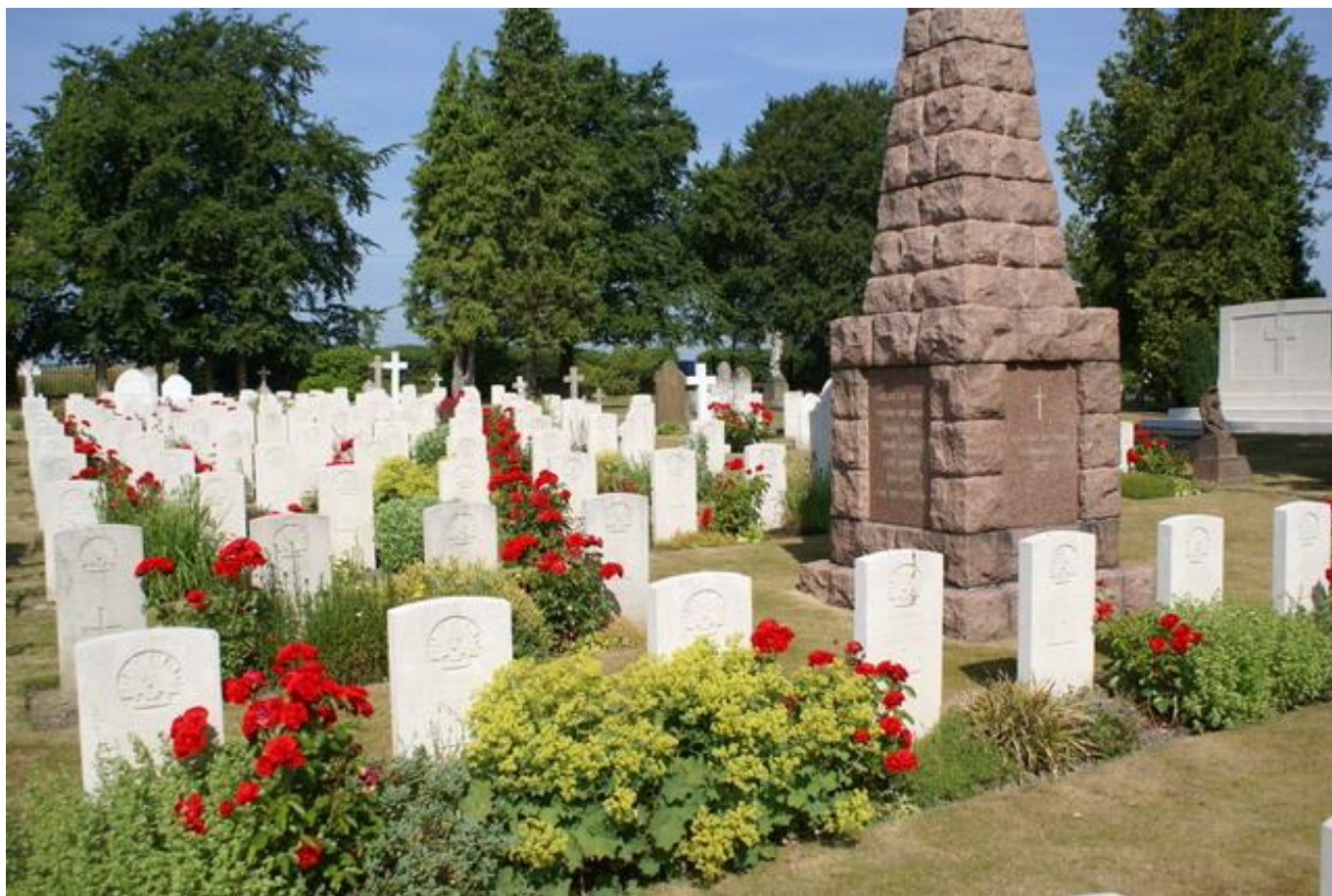
Durrington Cemetery, Wiltshire